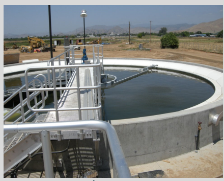
WEP Loans = $17,479,000 WEP Grants = $5,821,000